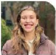
Kate Patten Communications