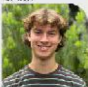
James Plank Wellbeing Portfolio